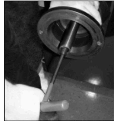
Figure 3: Install the Coupler