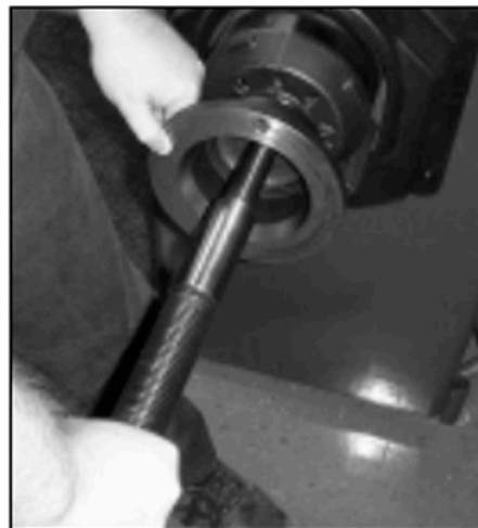
Figure 5: Rotate to Engage Coupler Threads