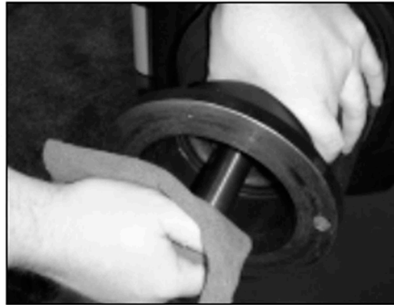
Figure 2: Clean the Motor Shaft