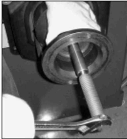
Figure 1: Remove Existing Stub Shaft

Order from McBay Performance, Inc. - www.McBayPerformance.com - Toll Free: 1-877-337-4177