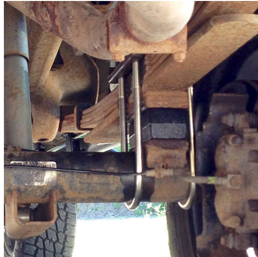
Figure 2: Round End Bolt Install

WARNING: This vehicle has been modified to enhance its performance. The steering, braking and handling of this vehicle will differ from standard passenger cars and trucks. This vehicle handles differently from an ordinary vehicle in driving conditions which may occur on streets, highways and off road. Avoid unnecessary abrupt maneuvers, sudden stops, sharp turns and other driving conditions that could cause loss of control, possibly leading to a roll over or other accident that could result in serious injury or death to driver and passengers. If larger tires are installed the speedometer will read lower than the vehicles actual speed.