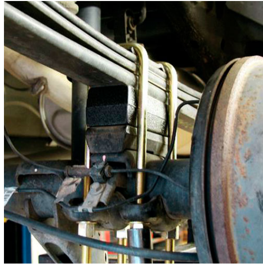
Figure 1: Square End Bolt Install