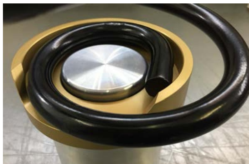
Figure 4: MP1626 Installation