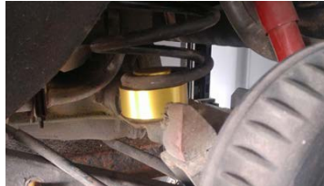
Figure 2: MP1628 Installed