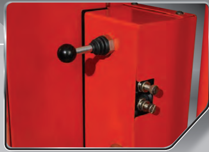
Responsive single lever air control for easy raising and lowering