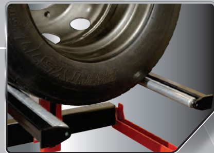
Steel rollers with high quality bearings for easy lug alignment