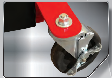
High quality rotating casters for easy maneuvers while carrying max load